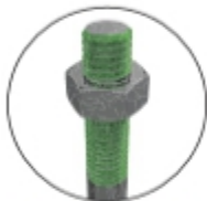
NUTS AND BOLTS