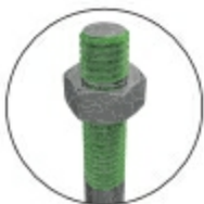
NUTS AND BOLTS

Nonfood Compounds Programme Listed H1 Registration 122320